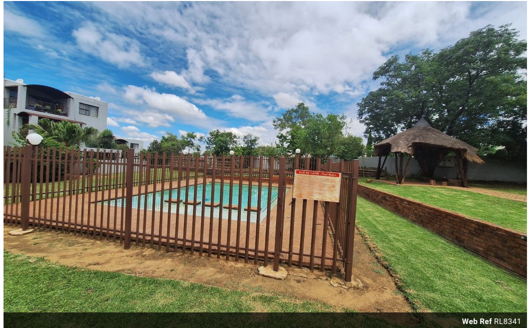
Web Ref RL8341

Thornhill Office Park Building 10 84 Bekker Rd Vorna Valley Midrand 1686