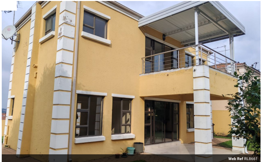
Web Ref RL8661

Thornhill Office Park Building 10 84 Bekker Rd Vorna Valley Midrand 1686