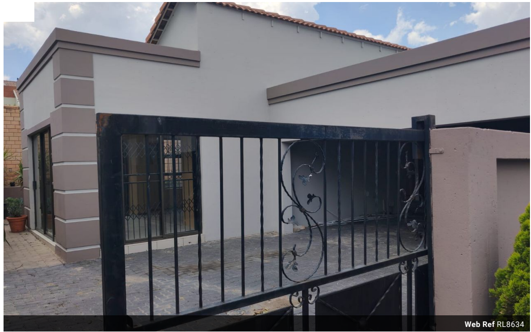
Web Ref RL8634

Thornhill Office Park Building 10 84 Bekker Rd Vorna Valley Midrand 1686