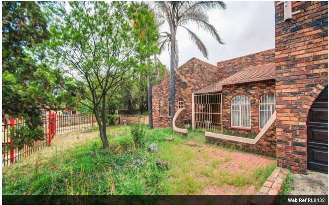
Web Ref RL8432