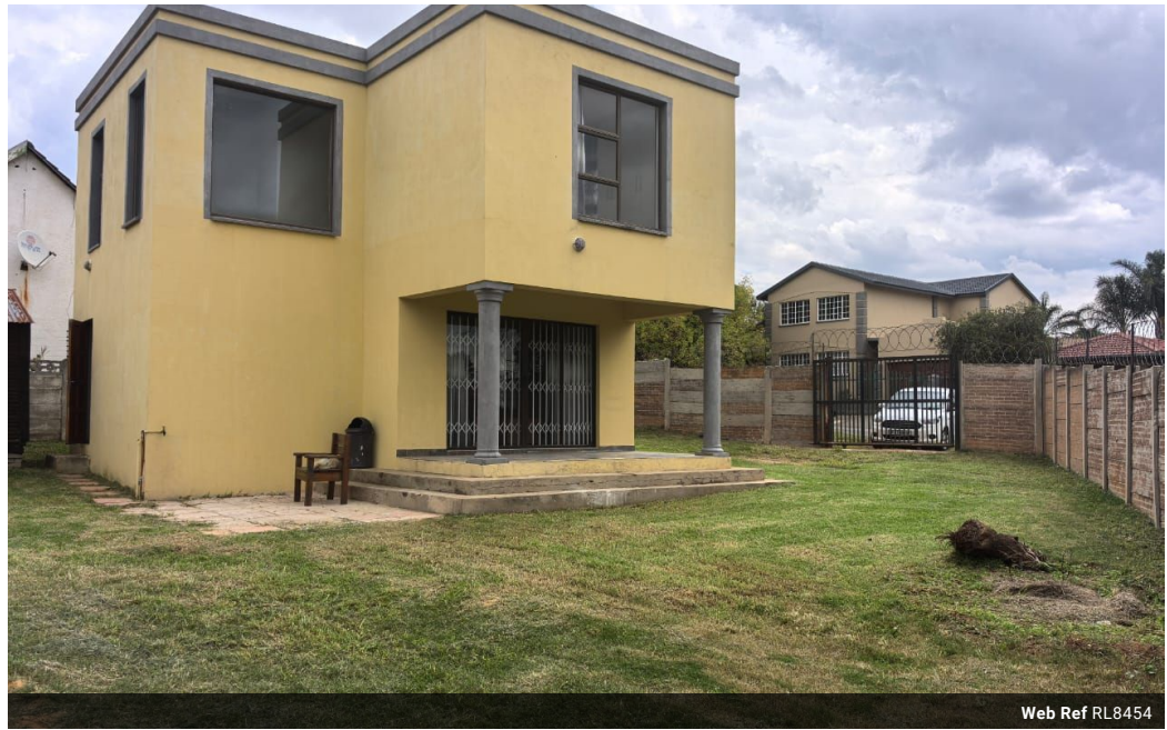
Web Ref RL8454

Thornhill Office Park Building 10 84 Bekker Rd Vorna Valley Midrand 1686