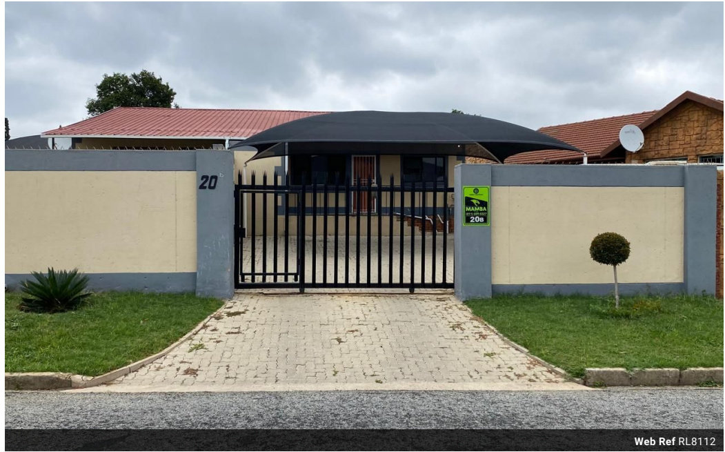
Web Ref RL8112

Thornhill Office Park Building 10 84 Bekker Rd Vorna Valley Midrand 1686