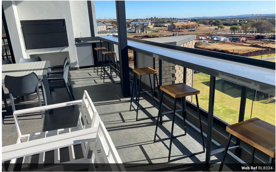
Web Ref RL8334