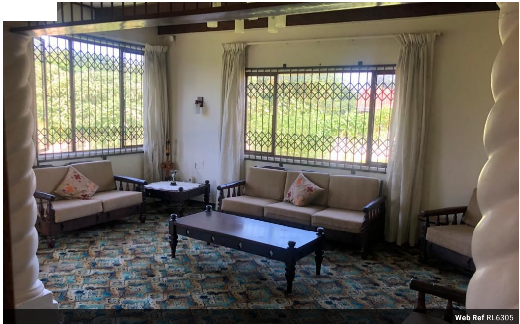
Web Ref RL6305

Thornhill Office Park Building 10 84 Bekker Rd Vorna Valley Midrand 1686