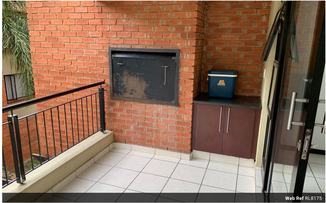
Web Ref RL8175