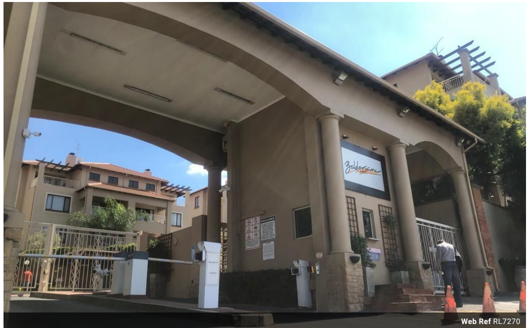
Web Ref RL7270

Thornhill Office Park Building 10 84 Bekker Rd Vorna Valley Midrand 1686