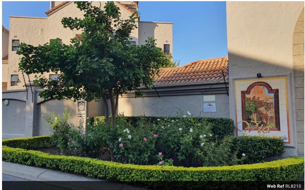
Web Ref RL8210