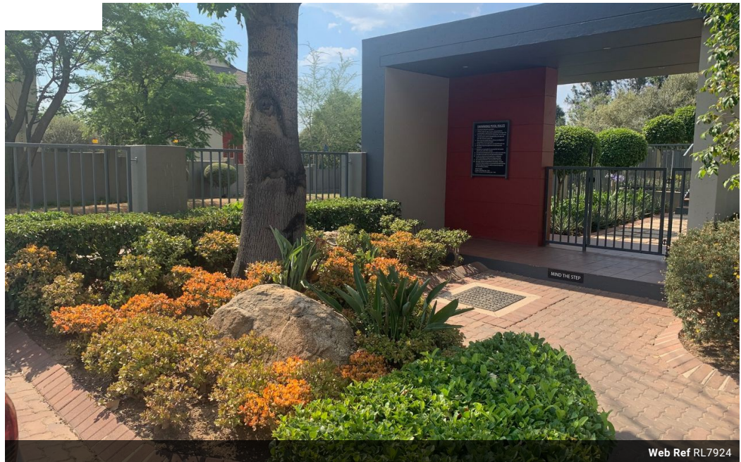
Web Ref RL7924