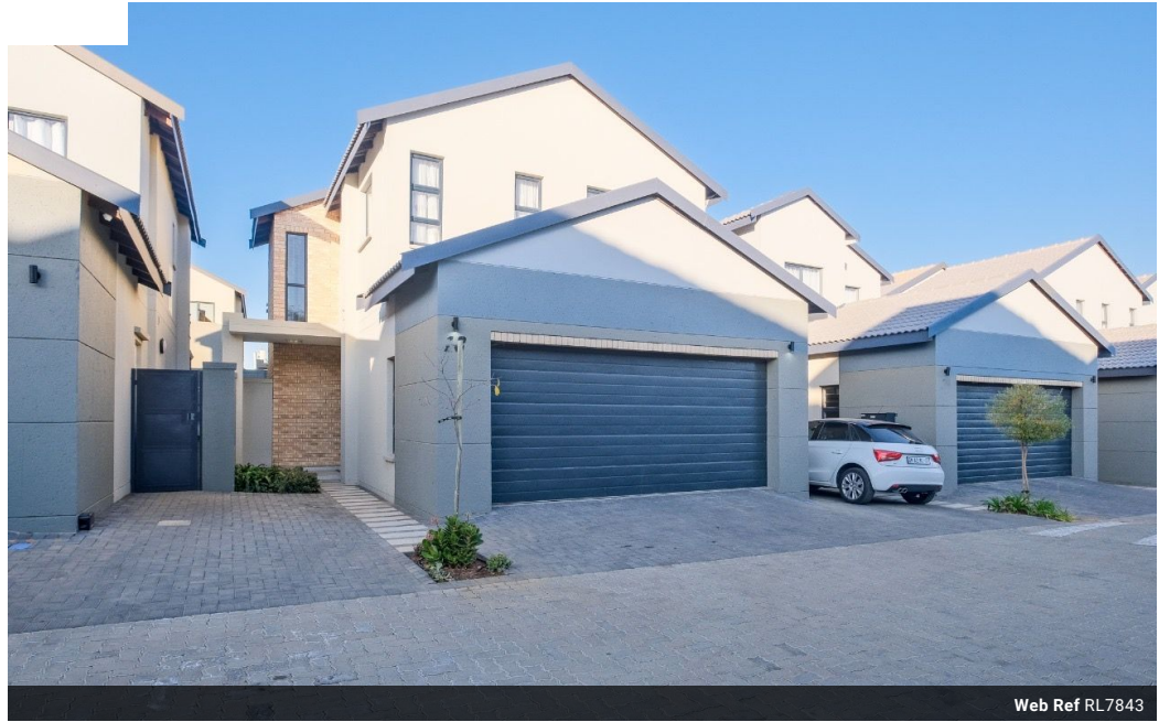
Web Ref RL7843

Thornhill Office Park Building 10 84 Bekker Rd Vorna Valley Midrand 1686