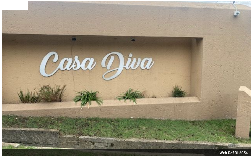
Web Ref RL8054

Thornhill Office Park Building 10 84 Bekker Rd Vorna Valley Midrand 1686