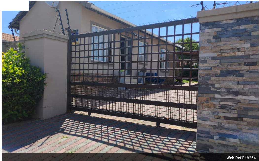
Web Ref RL8264

Thornhill Office Park Building 10 84 Bekker Rd Vorna Valley Midrand 1686