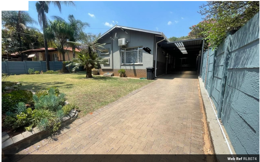
Web Ref RL8074

Thornhill Office Park Building 10 84 Bekker Rd Vorna Valley Midrand 1686