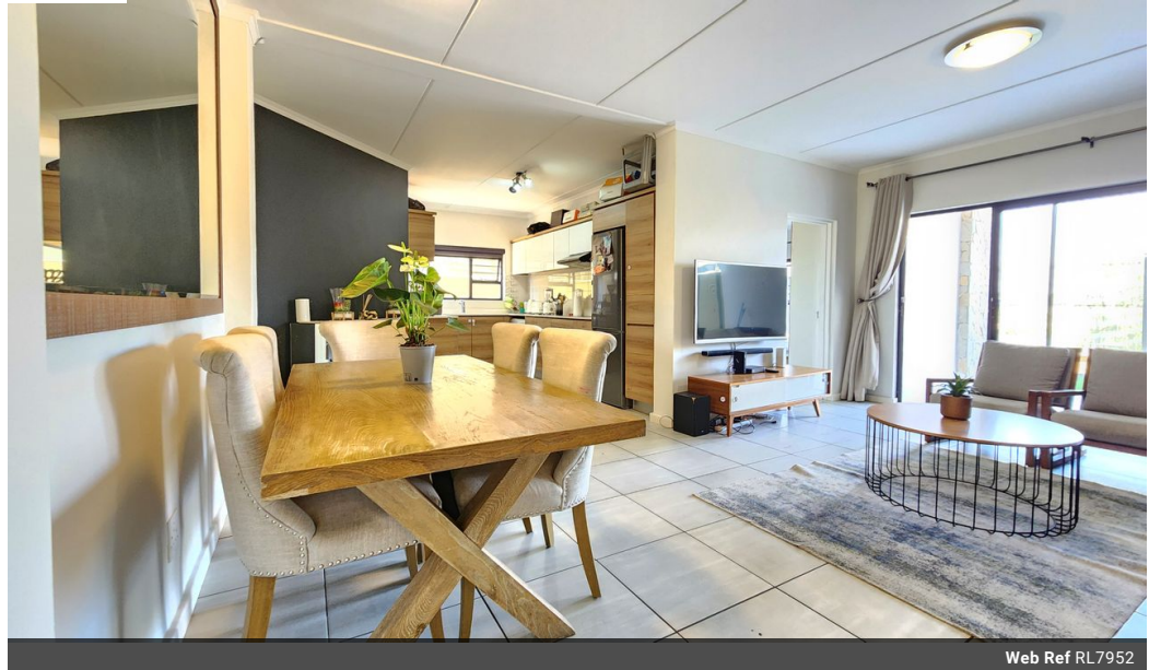
Web Ref RL7952

Thornhill Office Park Building 10 84 Bekker Rd Vorna Valley Midrand 1686