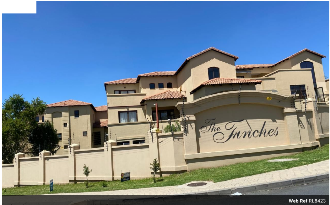
Web Ref RL8423

Thornhill Office Park Building 10 84 Bekker Rd Vorna Valley Midrand 1686