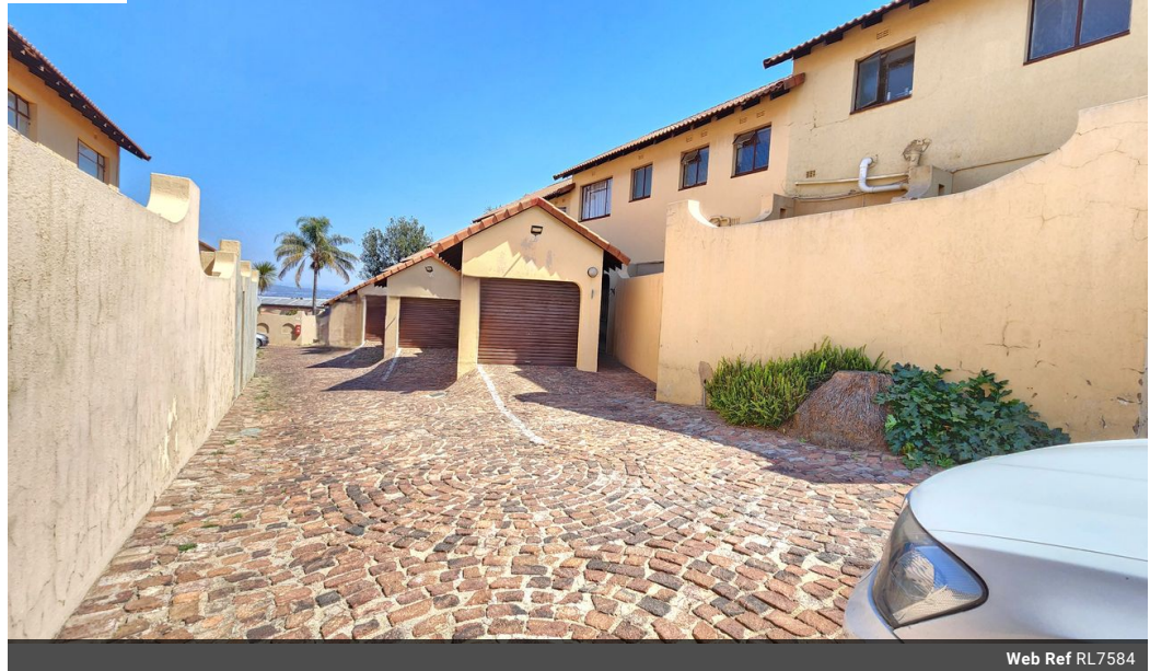
Web Ref RL7584

Thornhill Office Park Building 10 84 Bekker Rd Vorna Valley Midrand 1686