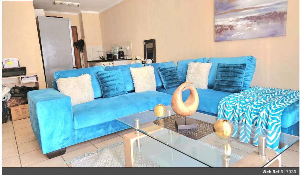
Web Ref RL7030

Thornhill Office Park Building 10 84 Bekker Rd Vorna Valley Midrand 1686