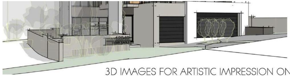
3D IMAGES FOR ARTISTIC IMPRESSION ONLY

Thornhill Office Park Building 10 84 Bekker Rd Vorna Valley Midrand 1686