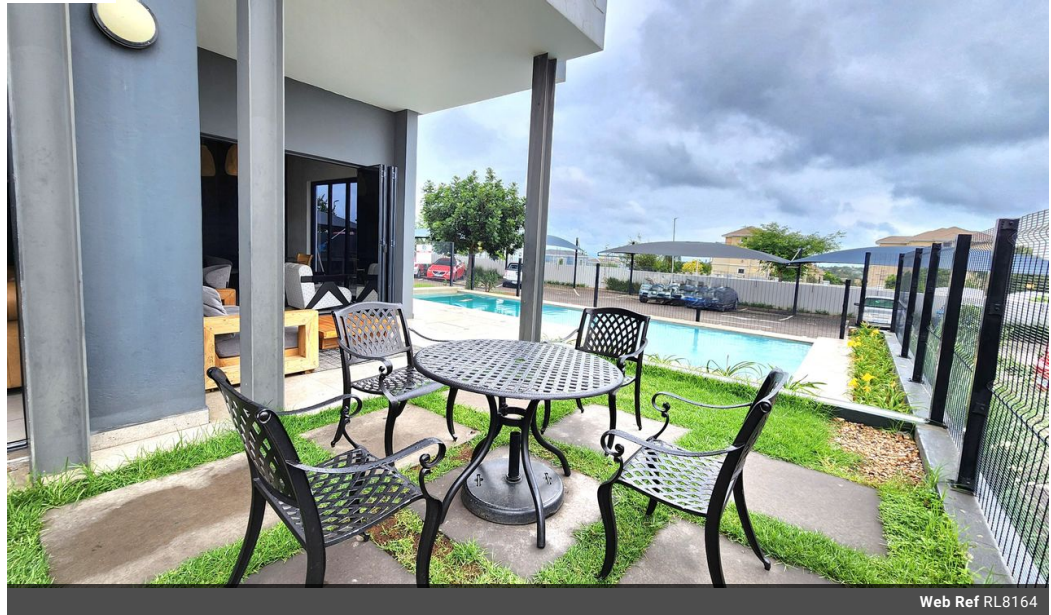
Web Ref RL8164

Thornhill Office Park Building 10 84 Bekker Rd Vorna Valley Midrand 1686