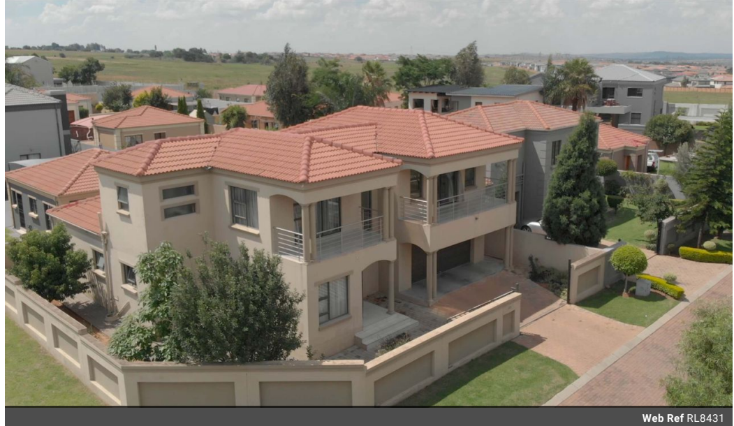
Web Ref RL8431

Thornhill Office Park Building 10 84 Bekker Rd Vorna Valley Midrand 1686