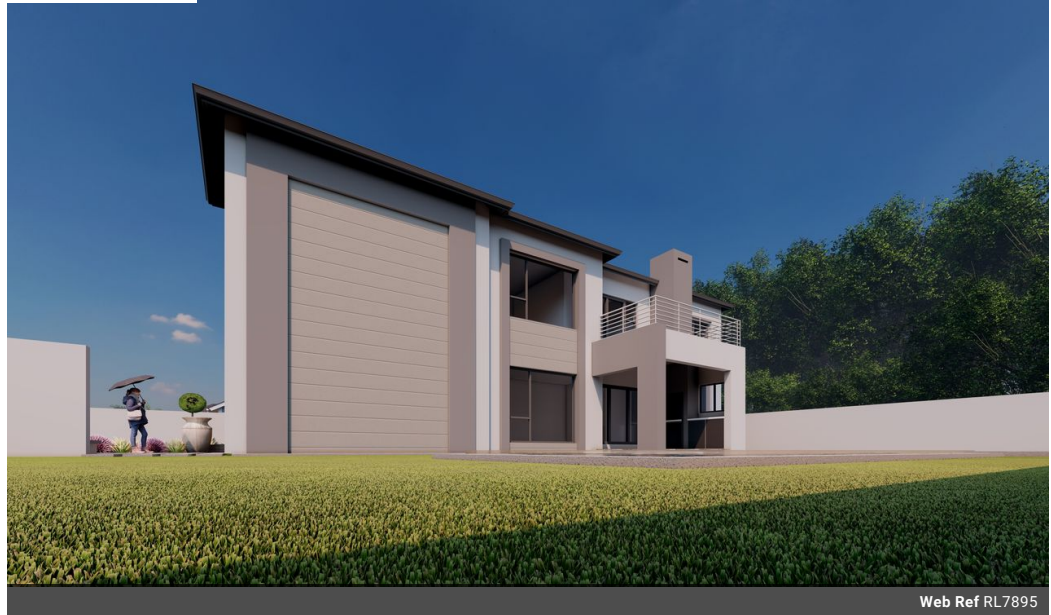
Web Ref RL7895

Thornhill Office Park Building 10 84 Bekker Rd Vorna Valley Midrand 1686