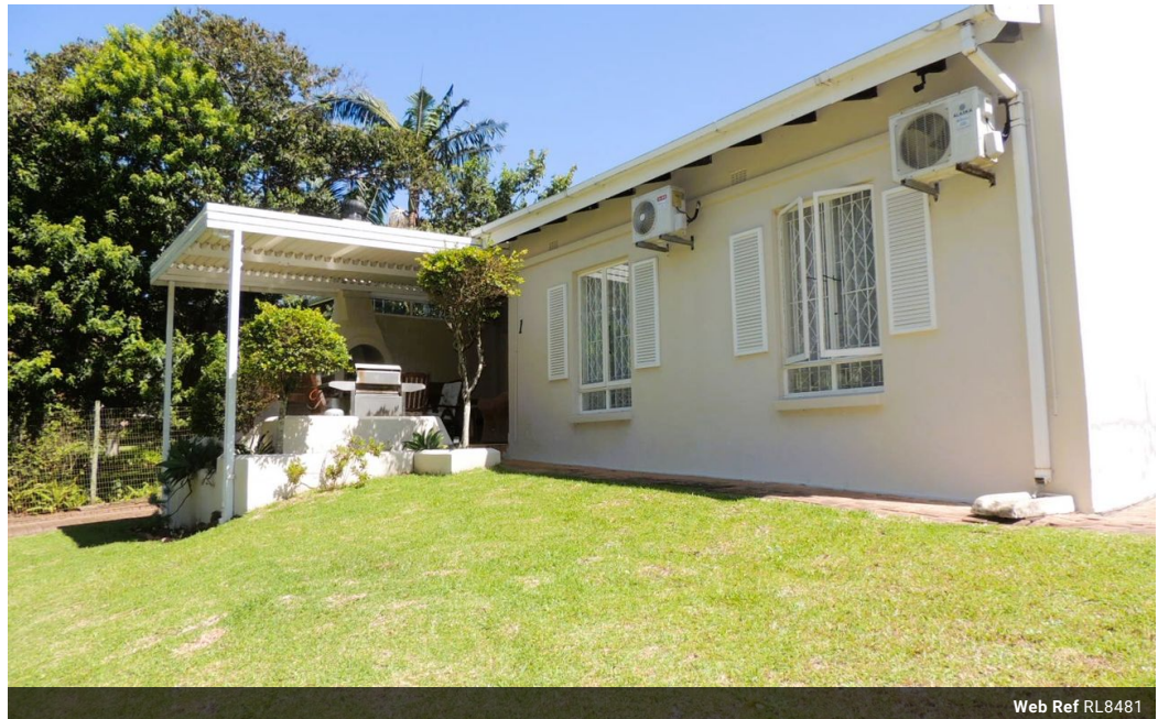
Web Ref RL8481

Thornhill Office Park Building 10 84 Bekker Rd Vorna Valley Midrand 1686