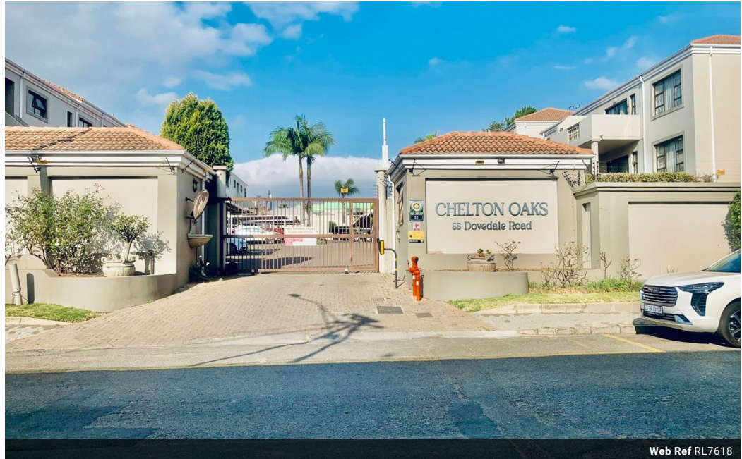
Web Ref RL7618

Thornhill Office Park Building 10 84 Bekker Rd Vorna Valley Midrand 1686