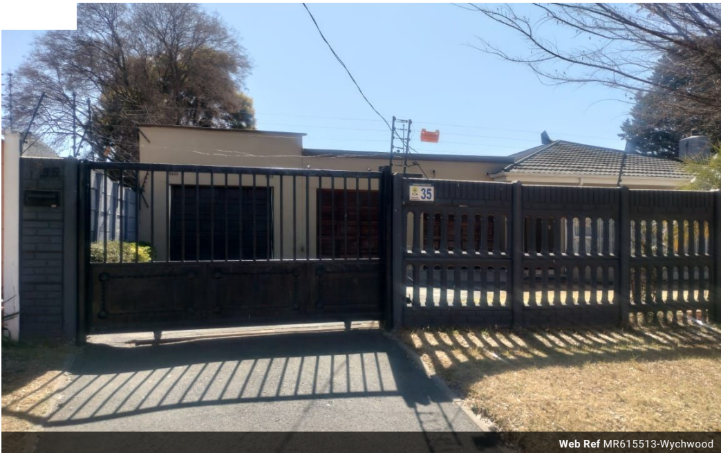
Web Ref MR615513-Wychwood

Thornhill Office Park Building 10 84 Bekker Rd Vorna Valley Midrand 1686