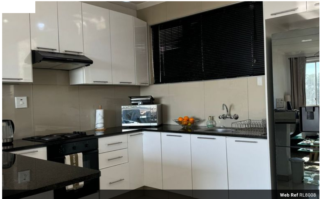
Web Ref RL8008

Thornhill Office Park Building 10 84 Bekker Rd Vorna Valley Midrand 1686