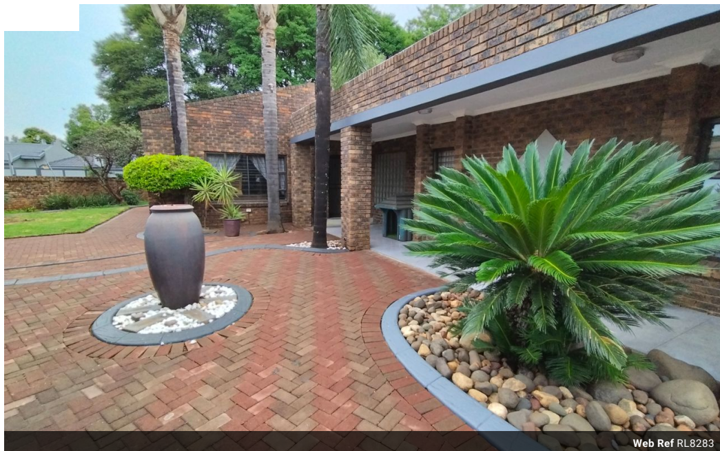
Web Ref RL8283

Thornhill Office Park Building 10 84 Bekker Rd Vorna Valley Midrand 1686