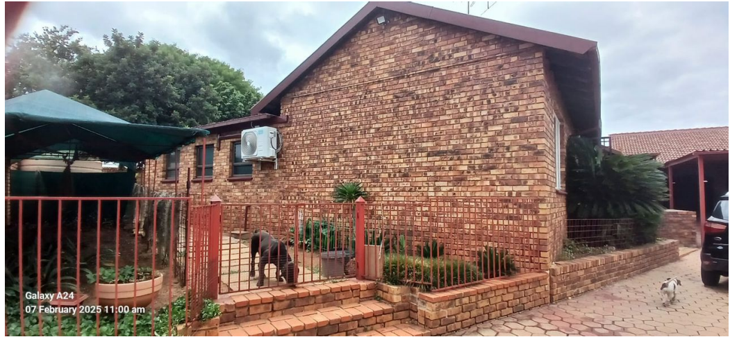
Galaxy A24 07 February 2025 11:00 am

Thornhill Office Park Building 10 84 Bekker Rd Vorna Valley Midrand 1686