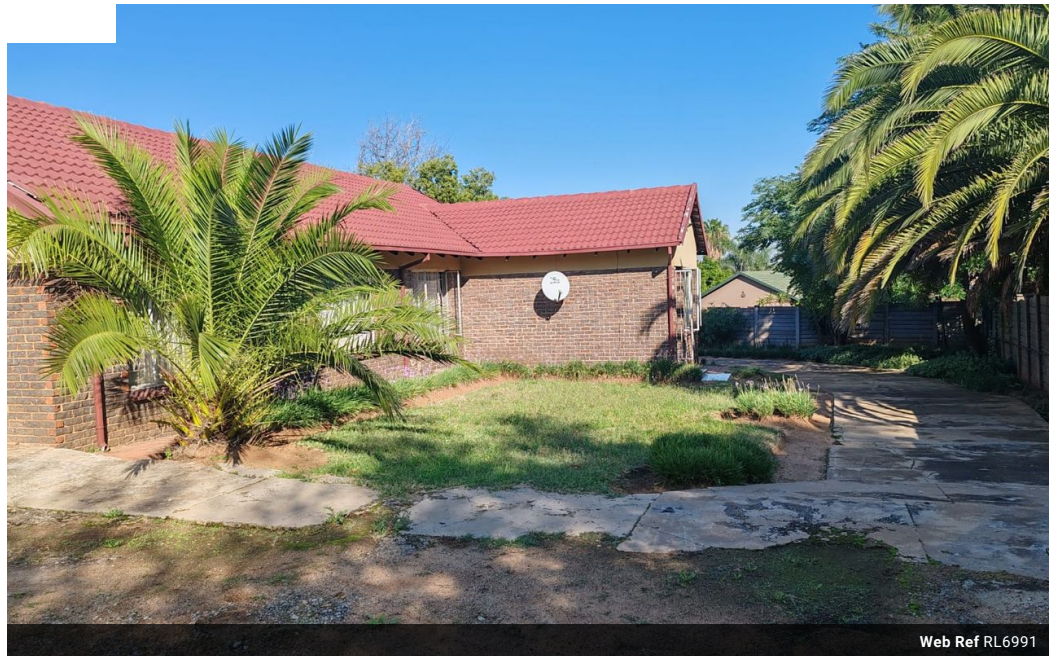
Web Ref RL6991

Thornhill Office Park Building 10 84 Bekker Rd Vorna Valley Midrand 1686