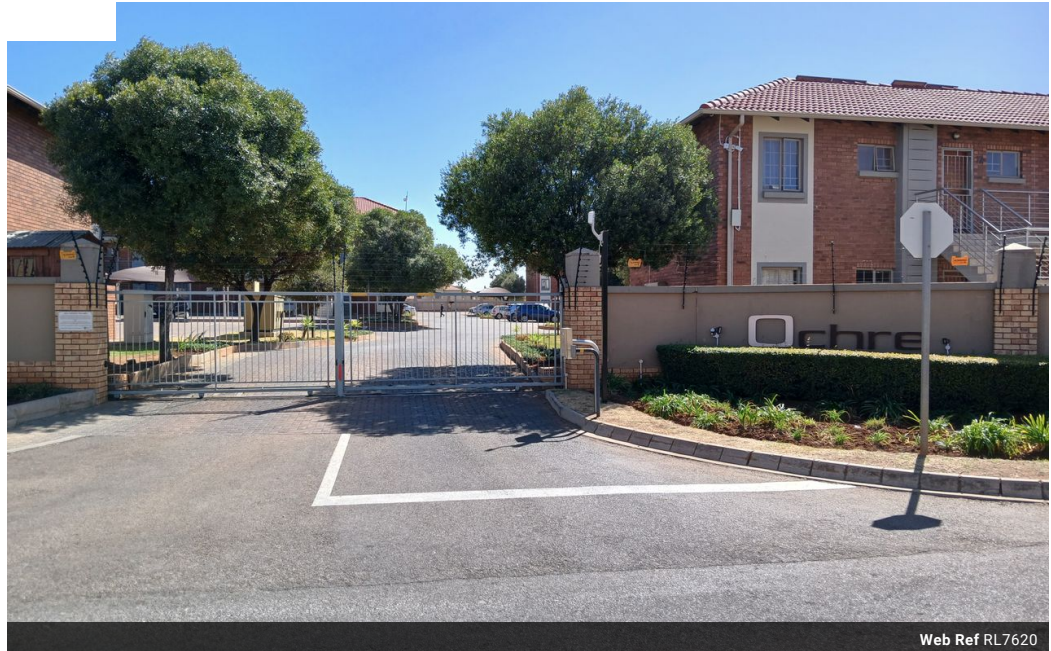
Web Ref RL7620

Thornhill Office Park Building 10 84 Bekker Rd Vorna Valley Midrand 1686