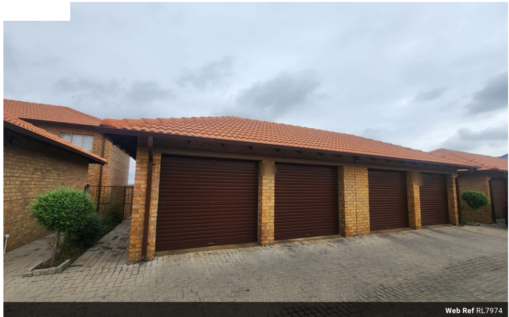
Web Ref RL7974

Thornhill Office Park Building 10 84 Bekker Rd Vorna Valley Midrand 1686