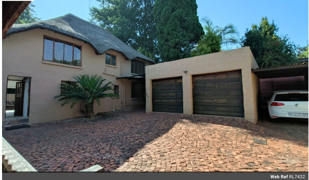
Web Ref RL7422