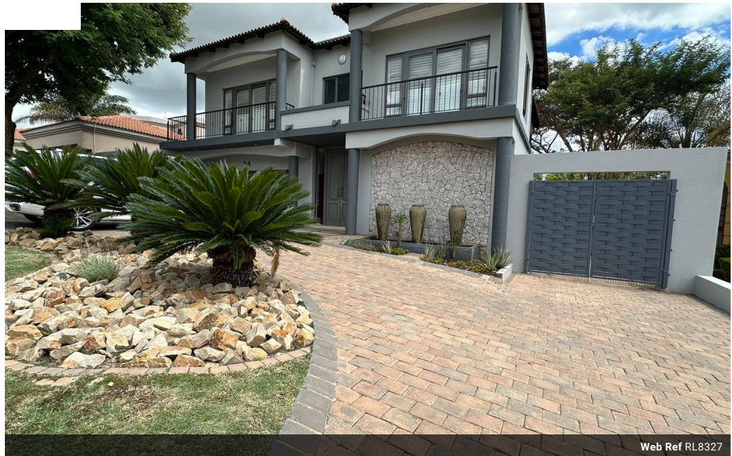
Web Ref RL8327

Thornhill Office Park Building 10 84 Bekker Rd Vorna Valley Midrand 1686