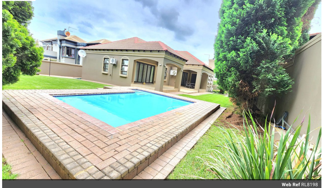
Web Ref RL8198

Thornhill Office Park Building 10 84 Bekker Rd Vorna Valley Midrand 1686