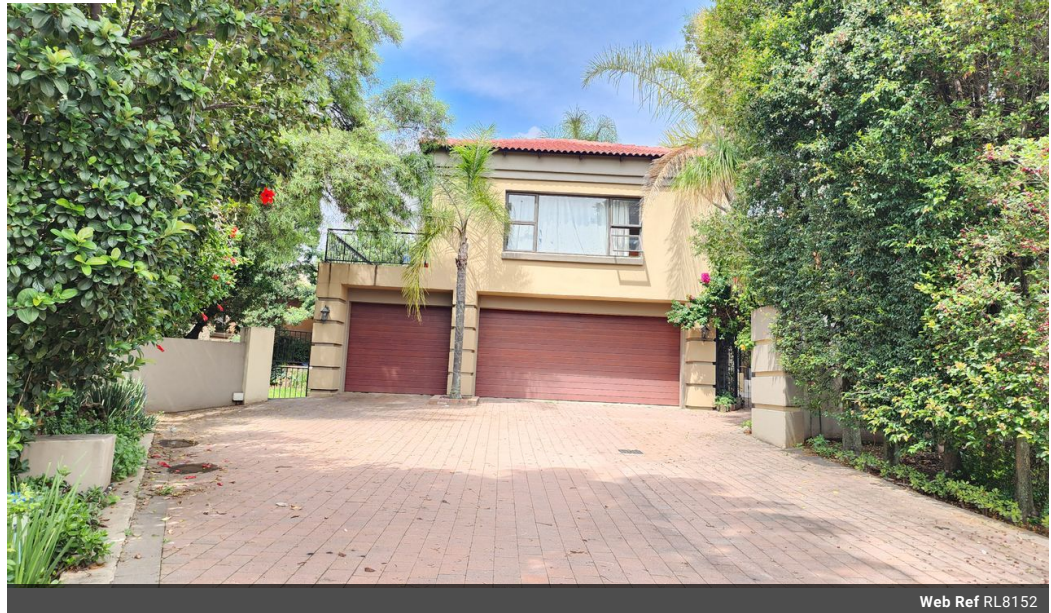
Web Ref RL8152

Thornhill Office Park Building 10 84 Bekker Rd Vorna Valley Midrand 1686