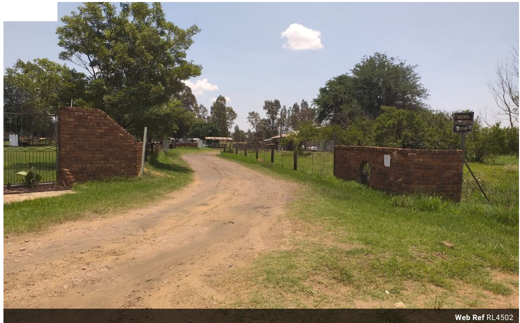
Web Ref RL4502

Thornhill Office Park Building 10 84 Bekker Rd Vorna Valley Midrand 1686