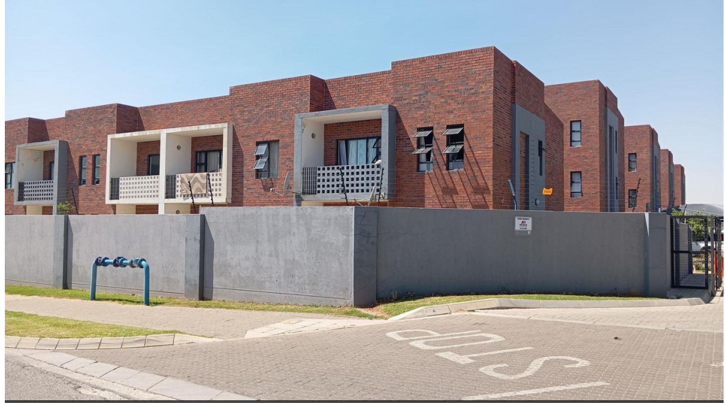
ON SHOW, SOLE MANDATE