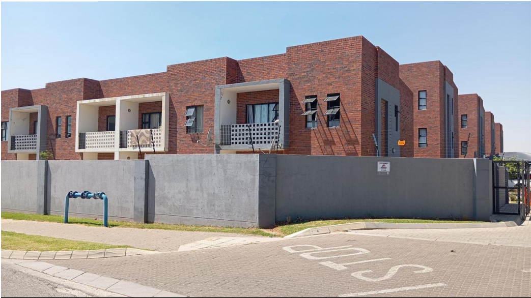
ON SHOW, SOLE MANDATE Web Ref TV001

Corner 13th Avenue and Paul Smit Ravenswood - Right across the road from AAA Security Call to book your viewing - No walk-in's allowed!! Bring the family