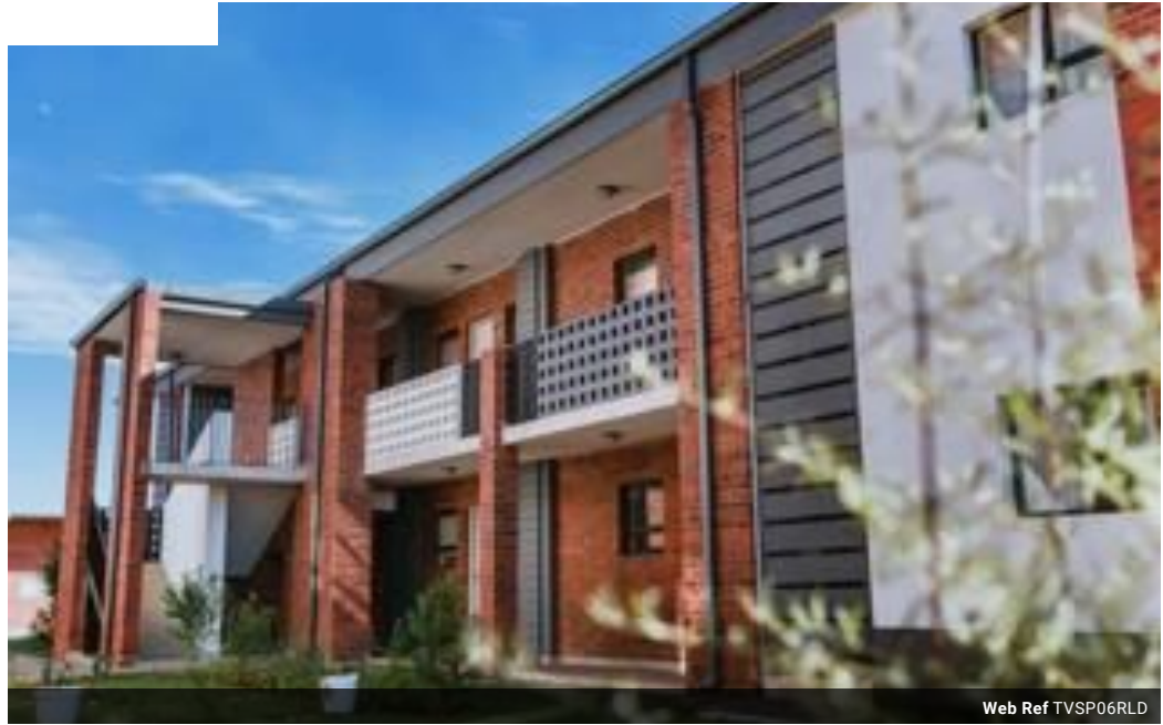
Web Ref TVSP06RLD

Thornhill Office Park Building 10 84 Bekker Rd Vorna Valley Midrand 1686