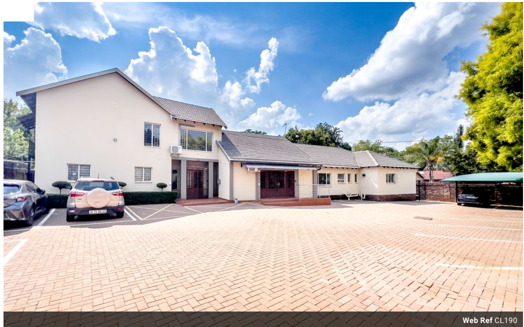
Web Ref CL190

Thornhill Office Park Building 10 84 Bekker Rd Vorna Valley Midrand 1686