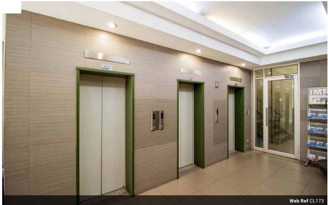
Web Ref CL173

Thornhill Office Park Building 10 84 Bekker Rd Vorna Valley Midrand 1686