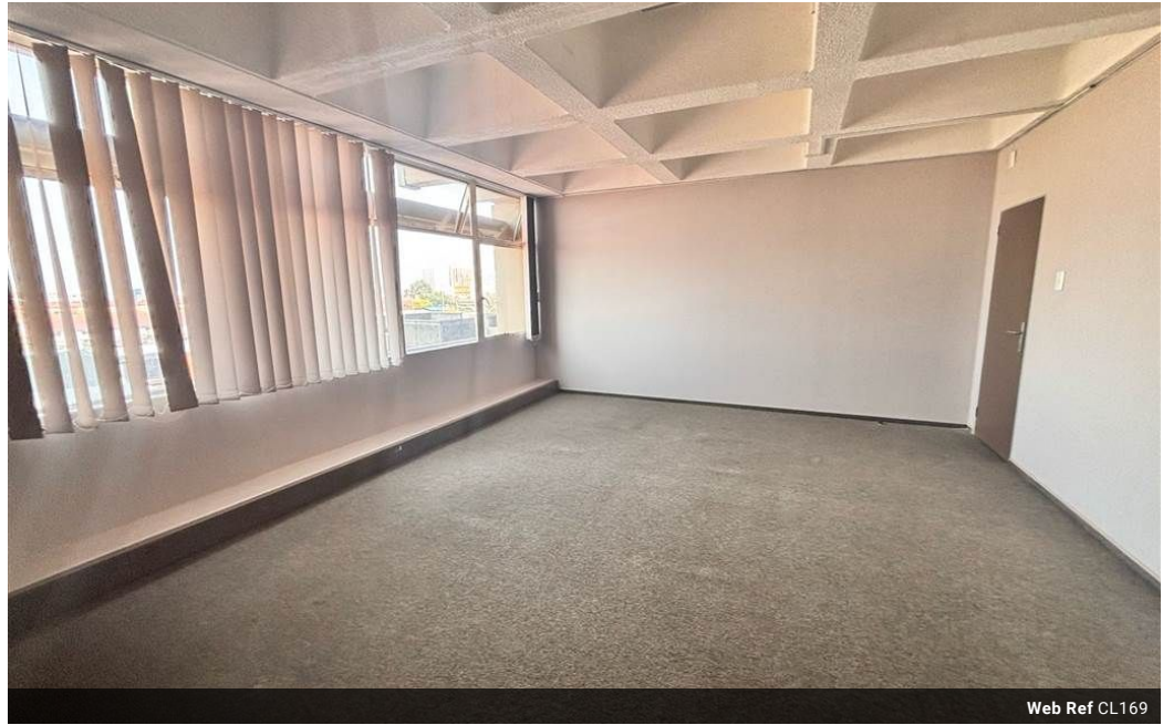
Web Ref CL169

Thornhill Office Park Building 10 84 Bekker Rd Vorna Valley Midrand 1686